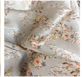
Textiles and silks