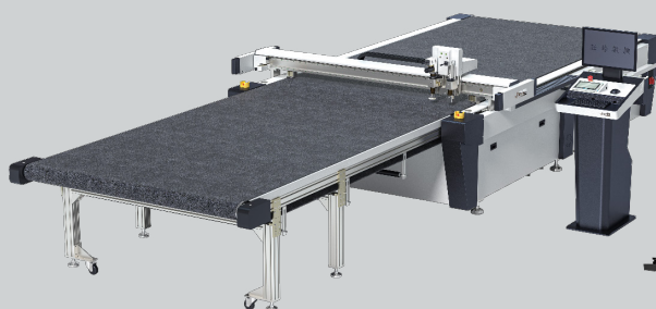
Model CB03II-2516-RQ CB03II-2518-RQ