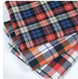
Pure cotton plaid